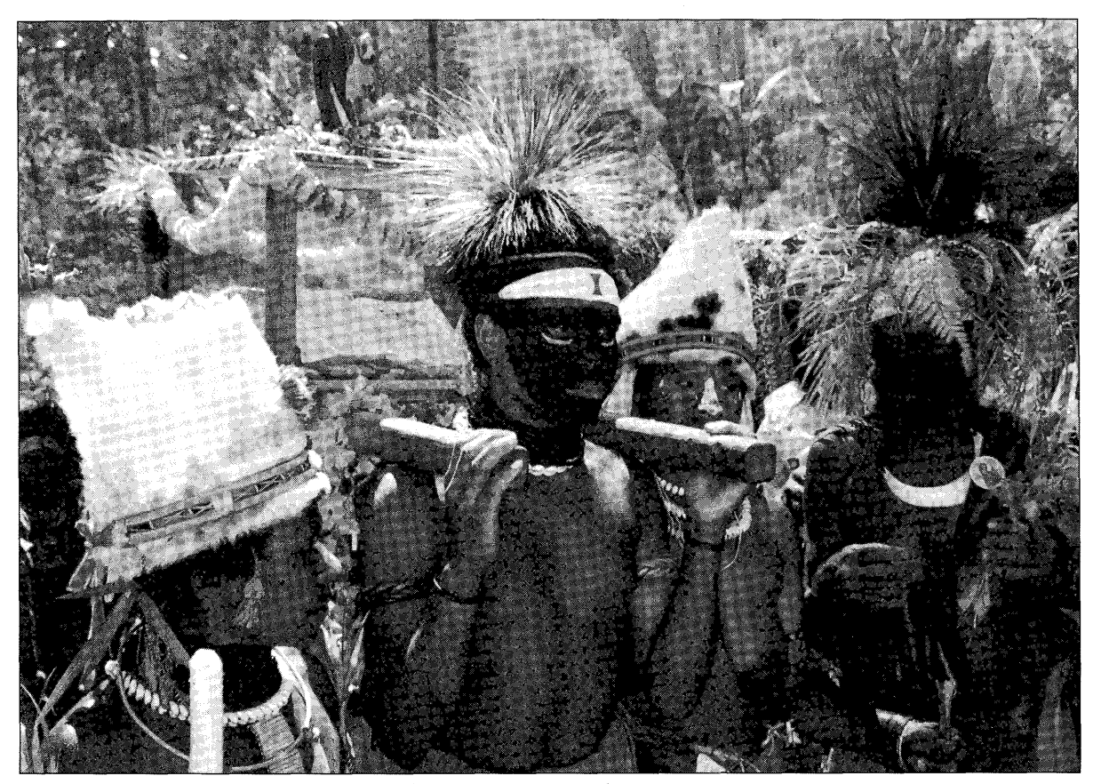
The Bokis Kontrak ark arriving at Kililamu, Kasap Parish